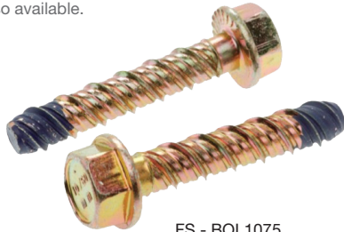
FS - BOL1075