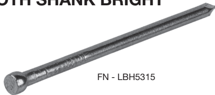
FN - LBH5315