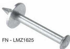
FN - LMZ1625